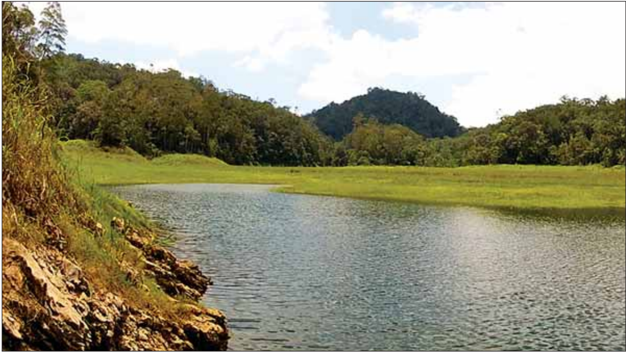
Fig. 6. Habitat of Melanotaenia sneideri at type locality, showing formation of small lake after heavy rains.