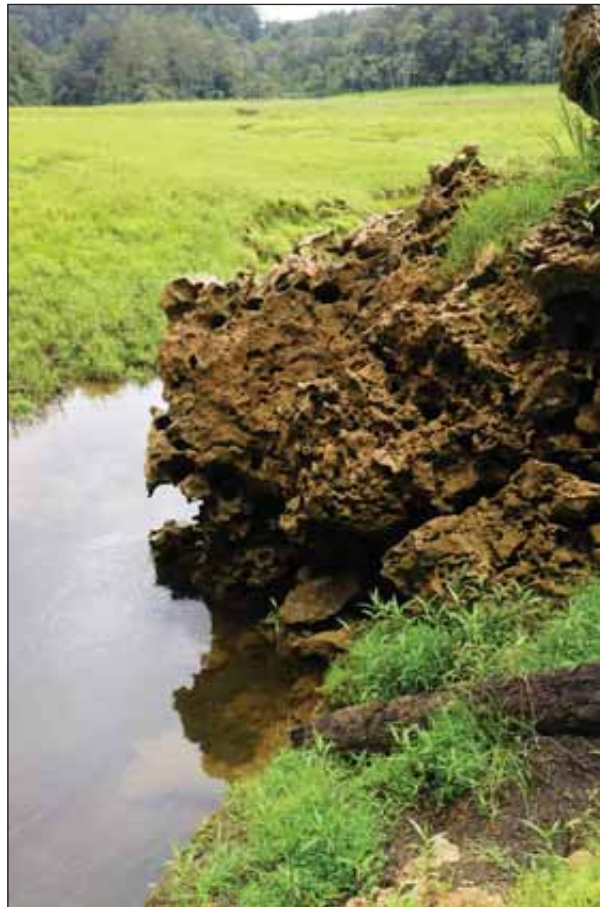
Fig. 5. Habitat of Melanotaenia sneideri at type locality, showing origin of creek.

Sexual dimorphism: Adult males are easily distinguished on the basis of the overall red colouration, which is lacking in females. Similar to most Melanotaenia , males are also deeper bodied than females. Unlike most members of the genus, which have a more elongate, pointed shape posteriorly on the soft dorsal and anal fins of males, the male of M. sneideri has a more evenly rounded anal-fin profile,