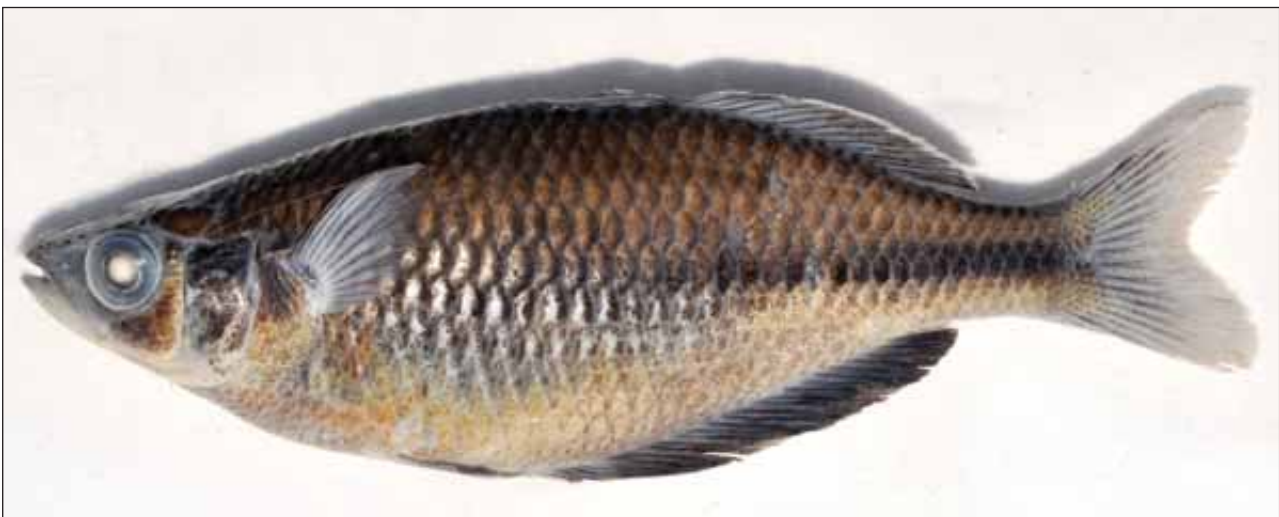
Fig. 4. Melanotaenia sneideri, preserved female, paratype (WAM P.33872-001), 79.4 mm SL.