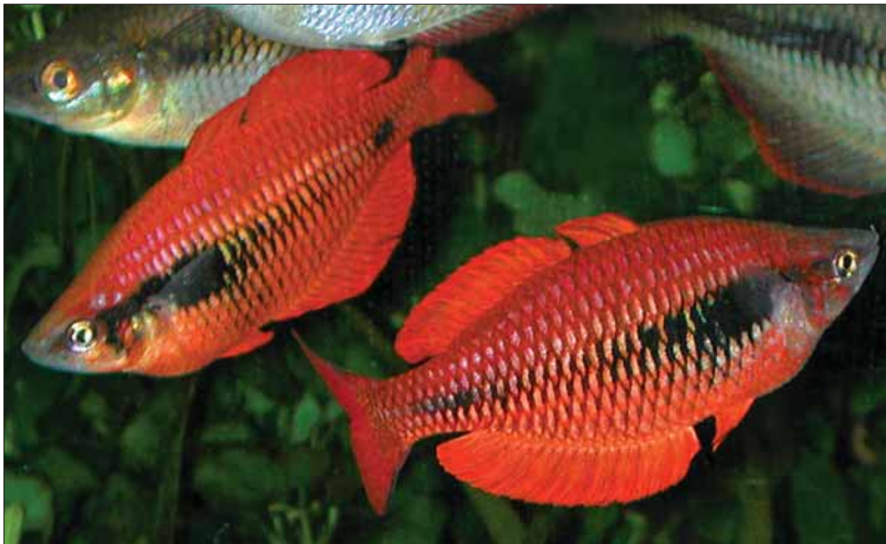
Fig. 7. Aquarium photograph of Melanotaenia parva , males, approximately 50 mm SL, Lake Kurumoi, West Papua Province, Indonesia.