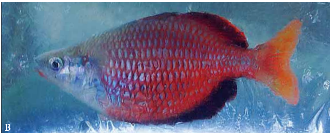
Fig. 2A-B. Live photographs of freshly collected holotype of Melanotaenia sneideri , male, 80.1 mm SL.