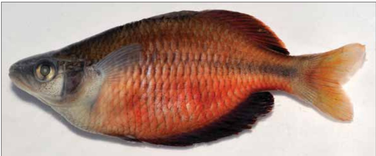
Fig. 3. Melanotaenia sneideri , preserved male, holotype, 80,1 mm SL.

(Fig. 4): brown on upper half of body, grading to whitish ventrally; broad (about two scale rows wide), mid-lateral black stripe on posterior half of body; dorsal, anal, and pelvic-fins blackish, except narrow white outer margin on second dorsal fin; opercle silvery grey with broad blackish area on uppermost portion; cheek brown; caudal and pectoral-fins translucent whitish, caudal with dusky grey rays on basal half. Small juveniles 15.1-27.4 mm SL, are either entirely whitish or pale grey on the dorsal half of the body and white on the lower half with a dark mid-lateral stripe that is vivid on the posterior one-third of the body (including caudal peduncle), but faint and inconspicuous on the anterior two-thirds.